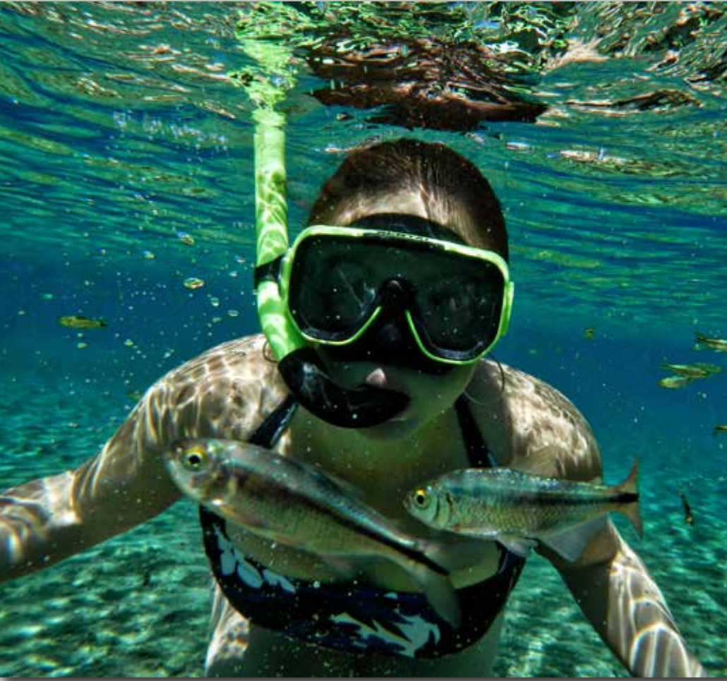
Snorkeling in the spring-fed pool at Balmorhea State Park.

The Civilian Conservation Corps built Balmorhea State Park around San Solomon Springs in the 1930s. Water gushing from San Solomon Springs fills the pool at Balmorhea State Park, then flows downstream through restored wetlands and canals in the park and beyond. Not only does the water refresh hot, dusty visitors, it is also home for several rare and endangered species. The pool is up to 25 feet deep and covers 1.3 acres; it is one of the world’s largest swimming pools. The water temperature stays at 72 to 76 degrees year-round.