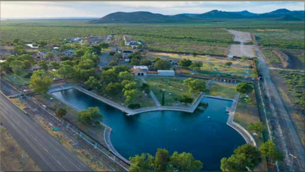
Aerial view of the pool at Balmorhea State Park.

Texas Parks and Wildlife Department limits the number of park visitors to 650 people daily. Advanced purchase of day passes is strongly encouraged during the summer, weekends, and holidays, as day-use passes often sell out at those times. No nets or feeding of fish are permitted in the pool. No lifeguard is on duty. The pool is open daily, year-round. Swimmers pay only the park entry fee.