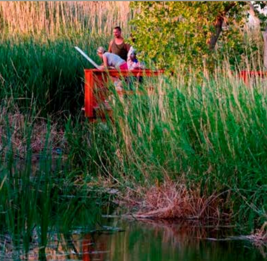
Visitors at the wildlife viewing platform in the restored wetlands.

The Reeves County Groundwater Conservation District was created in 2013 to manage groundwater pumping, promote conservation, and protect water quality. In 2016, the Texas Parks and Wildlife Department formed a working group of scientists to develop a biomonitoring plan for the springs to monitor changes in spring flow and water quality and to recommend methods for oil and gas operators to minimize impacts to the springs. A USGS flow and water quality monitoring site was reestablished in 2017 near the historic flow station that operated from 1932 to 1965. In 2018-19, Texas Parks and Wildlife Department, with support from Apache Corporation, the Texas Wildlife Foundation, and many individuals and organizations, made major structural repairs to the historic pool, hotel and cabins. Ongoing education and monitoring helps minimize impact from park visitors on the sensitive wetlands.