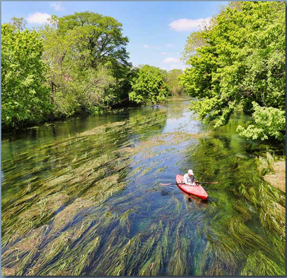
Photo of a kayaker surveying Texas Wild Rice, an endangered species, on the San Marcos River.

Spring flow at San Marcos Springs serves as a drought trigger for groundwater users within the Edwards Aquifer Authority area. Robust conservation easement, alternate supply, voluntary irrigation suspension, and drought management programs spearheaded by the Edwards Aquifer Authority help to protect and enhance recharge and conserve water during drought. The Edwards Aquifer Authority, City of San Marcos, Texas State University and several other partners have established a Habitat Conservation Plan here and at Comal Springs to protect Edwards Aquifer spring flow and water quality. The City of San Marcos and Texas State University are collaborating to implement habitat restoration projects in and around Spring Lake and the Upper San Marcos River to mitigate effects their Edwards Aquifer groundwater pumping.