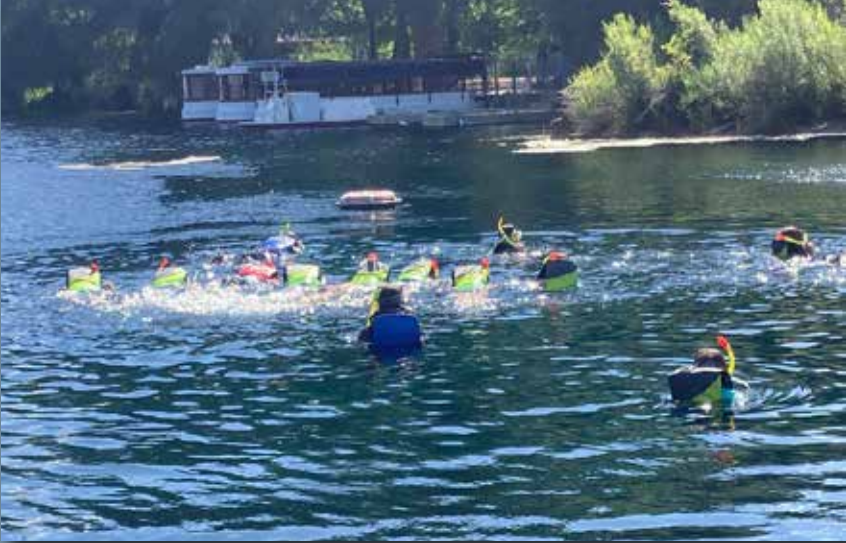
Photo of a Aquatic Science Adventure Camp Snorkel Tour, Edwards Aquifer Research and Data Center.

Spring Lake is open year-round. The Meadows Center offers glass-bottom boat tours, kayak, and snorkeling tours, and trainings for groups and the public. The Discovery Hall and hiking trails through the Natural Area and Wetlands Boardwalk are also free to the public. The Edwards Aquifer Research and Data Center hosts an Aquatic Science Adventure Summer Camp focused on learning and exploring area springs, creeks, and caves.