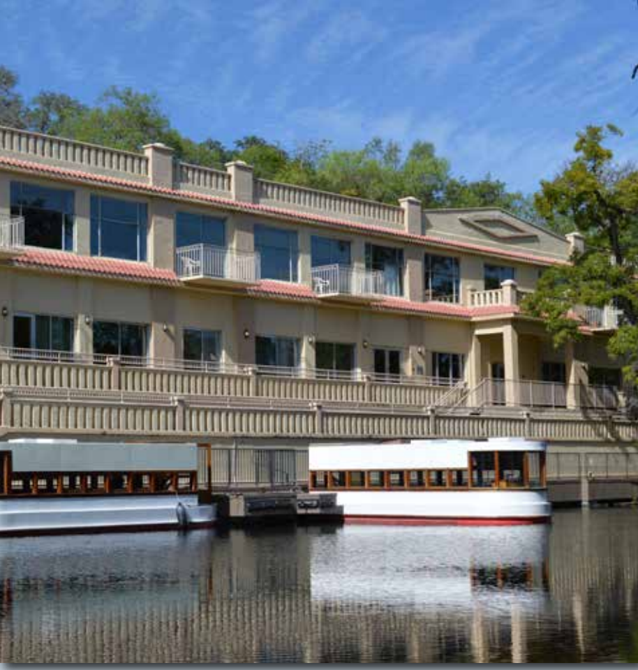
Photo of two glass-bottom boats on Spring Lake in front of the Meadows Center.

San Marcos Springs is made up of more than 200 artesian springs that bubble up from the Edwards Aquifer to form Spring Lake and the headwaters of the San Marcos River. Spring Lake was purchased in 1994 by Texas State University and is now managed by the Meadows Center for Water and the Environment. Formerly known as Aquarena Springs, Spring Lake hosted attractions like rides, mermaids, and Ralph the swimming pig. Aquarena’s past is remembered fondly, but Spring Lake is now managed more sustainably.